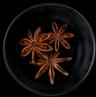
Herbs and spices

Herbs, spices, citrus, vanilla, cheese, seafood, meat and poultry are just the beginning.