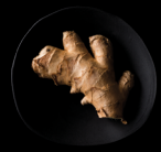
Botanical extracts (coming soon)