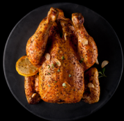
Meat and poultry